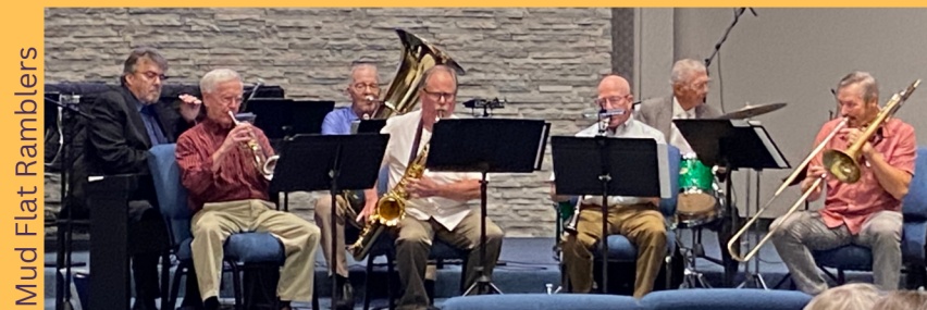
Mud Flat Ramblers